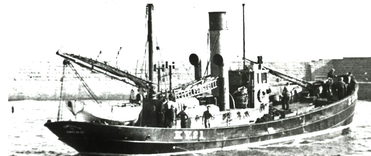
Cosmea/ Coriedalis, KY21, Last Scottish steam drifter to visit Great Yarmouth in 1956