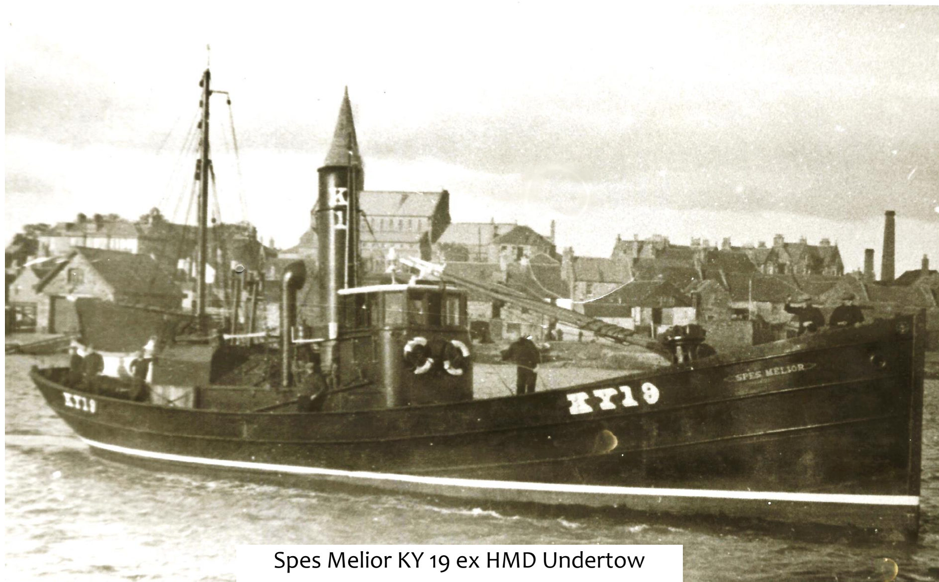
Spes Melior KY 19 ex HMD Undertow

These vessels were 86ft long, could steam at 9 knots. 42 HP, with a coal carrying capacity of 37 tons.